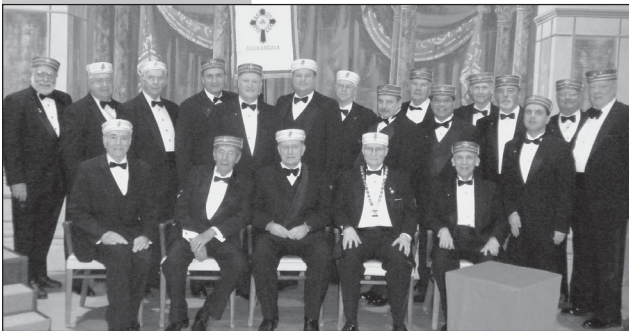
The Alexandria Valley KCCH Investiture Team